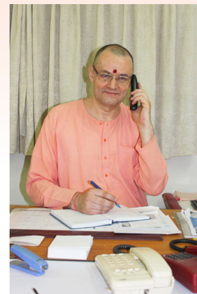
Shri Swami Satchidananda Saraswati