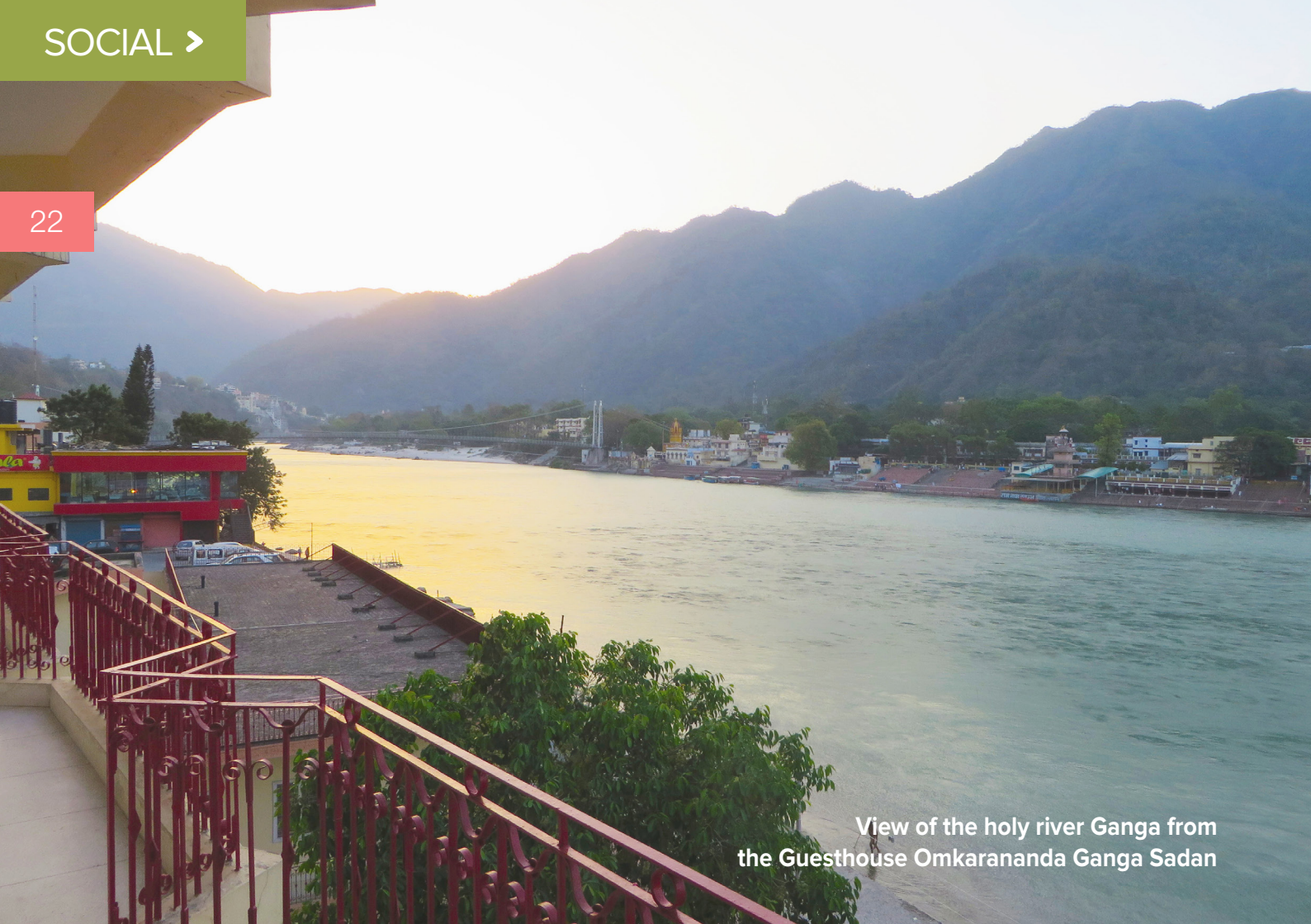
View of the holy river Ganga from the Guesthouse Omkarananda Ganga Sadan