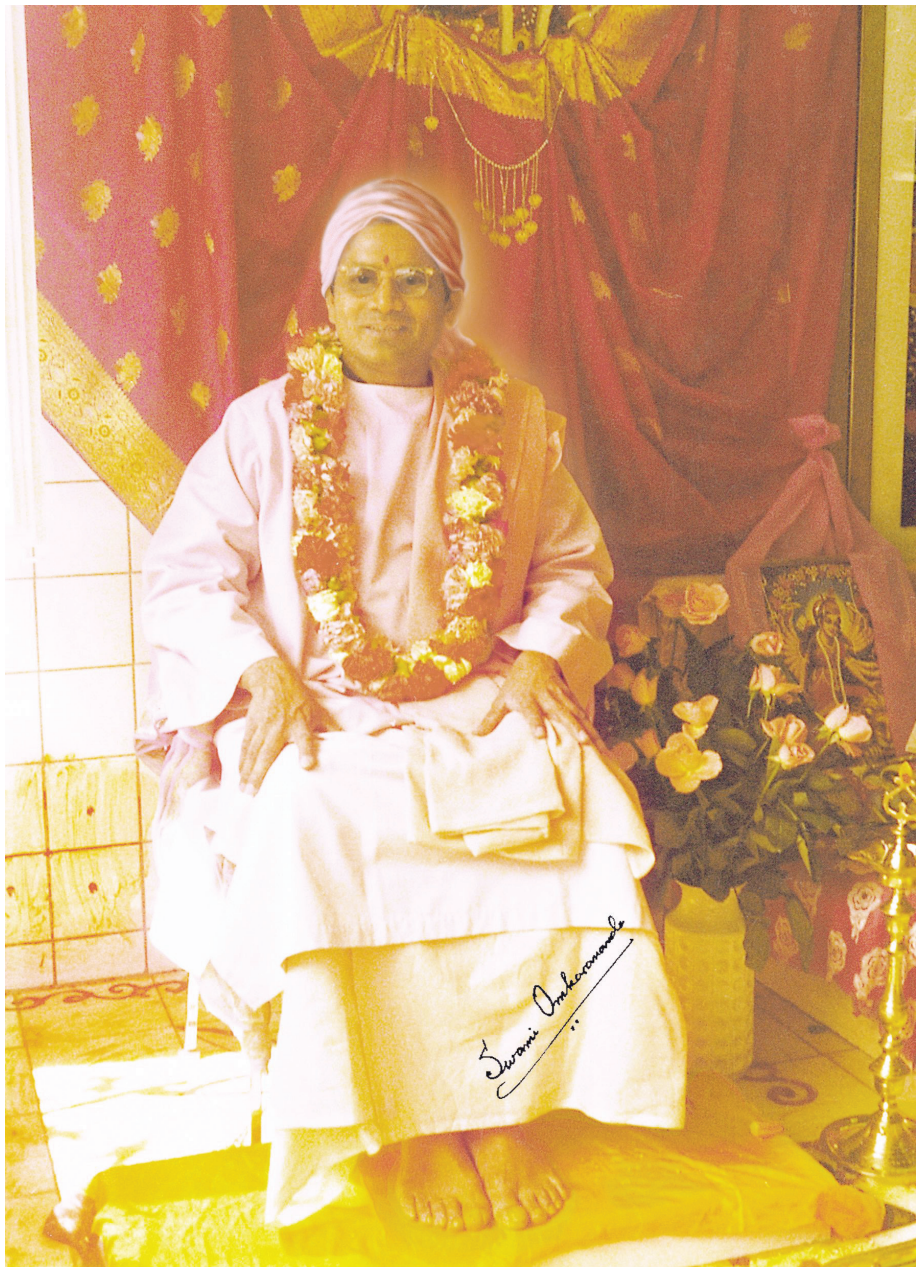
H.D. Shri Paramahansa Omkarananda Saraswati